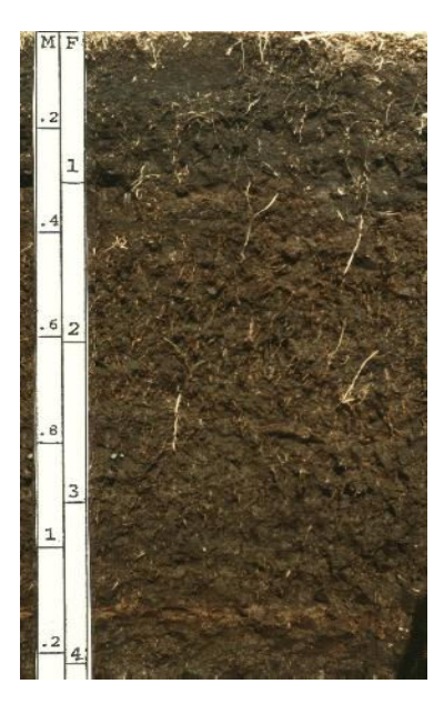
Figure 4: Soils routinely found to be deficient in silicon. Left = Oxisol, Middle = Ultisol, Right = Histosol

Problems due to a lack of silicon in soil can get worse over time, especially if cultivating silicon hyperaccumulating crops, such as cereals. The harvestable biomass removed will be taking away biologically available silicon, as will any crop residue removed after harvest (hay, straw, foliage etc). Unless replaced at the same rate by weathering or fertilizer addition, this loss of available silicon will eventually lead to crop losses. For this reason, silicon fertilization is now routine in rice and sugar cane crops, especially in soils with very low available silicon. These fertilizers are not used just to boost yield, they are now considered essential to avoid major crop losses.