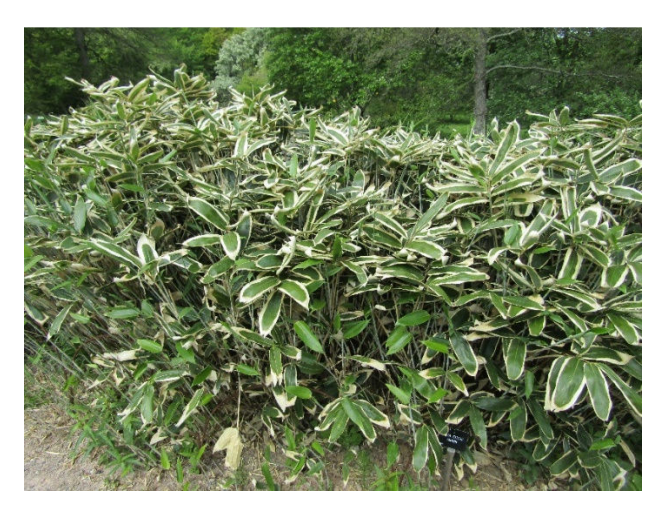
Figure 1: the bamboo Sasa veitchii; 41% SiO<sub>2</sub> by dry weight.

Monocot plants can accumulate extremely high concentrations in their tissues. For example, the bamboo Sasa veitchii (figure 1) in which an astonishing 41% of the dry weight is silica (SiO<sub>2</sub>). As the absorption of silicon into plants is an active controlled process (not passive diffusion), the plant would not absorb and deposit such massive levels of silicon unless it was performing major beneficial functions.