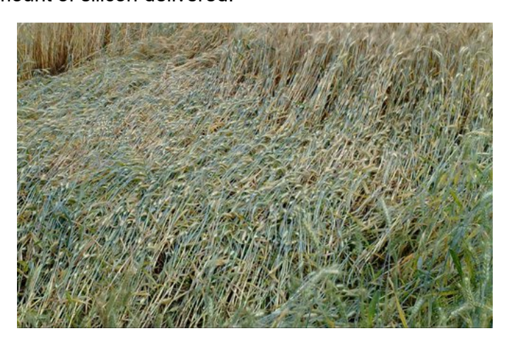
Figure 3: A wheat crop that has lodged following heavy rain and wind. The mechanical strength provided by adequate silicon nutrition can help prevent such losses of crops.

The silica that is deposited in the walls of the cells in the foliage and stems contribute significantly to their mechanical strength and rigidity and supplying supplemental silicon in the fertigation stream has been shown in multiple independent studies to enhances the strength and rigidity of cell walls. Stronger cell walls are important as they contribute to resisting lodging in cereal crops in windy conditions (figure 3). In addition, enhanced leaf thickness, erectness, and rigidity improves the exposure of leaves to light; an effect that has been shown to increase in relation to the amount of silicon delivered.