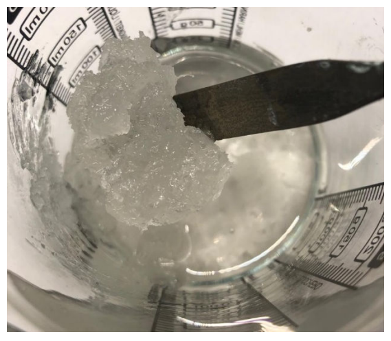
Figure 6: Left = Potsil's silicon component as a fully soluble liquid (minus multifunctional additives and natural pigment). Right = When phosphoric acid is added to the solution an insoluble gel has formed which will permanently lock up the silicon nutrient and can block filters, pipes and spray nozzles.

Apply 'little and often' for best results. Applying regularly helps maintain silicon levels in tissues as they grow. As silicon cannot be moved around the plant in the phloem a constant available supply is needed to promote growth and protect the crop from pests and disease. Applying little and often also helps prevent major sudden changes in foliar and soil pH. In hydroponics Potsil can be applied continuously throughout the growing cycle in the fertigation stream.