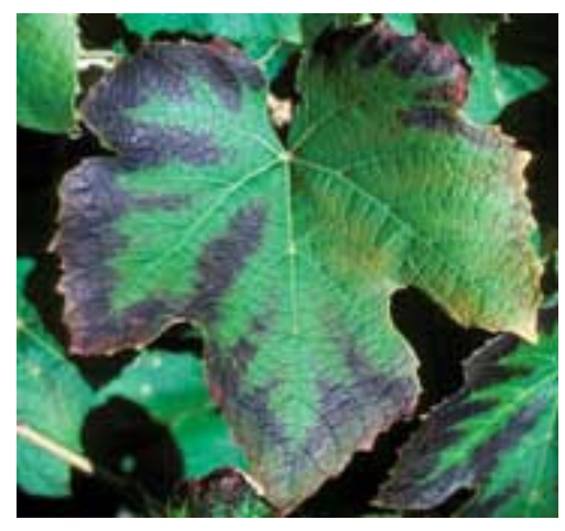
Figure 5; Classic symptoms of potassium deficiency in tomato (left) and grape (right).

There are number of options for adding potassium to a crop, but each has an associated drawback;