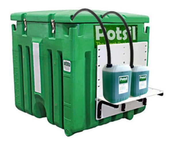
Figure 7: Autodosing Potsil into a hydroponic system.

Automated systems; Apply Potsil at 1.0-2.0mL per litre using a dedicated Dosatron/Solanoid. Study the effect of Potsil's alkalinity on your fertigation stream and adjust your acid solenoid in accordance.